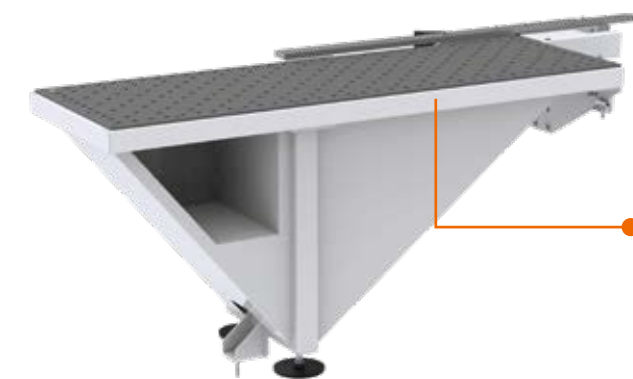
Air cushion table Easily handling even for heavy panels.

Standard Optional x Not possible Free space